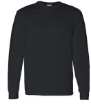
Long-Sleeve Unisex Tees $19/$22*