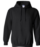
Hooded Unisex Sweat Shirts $27/$30*