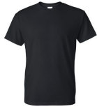
Basic Unisex Tee $17/$20*