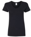
Ladies V-Neck Tee $19/$22* Adult Sizes Only