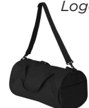
Logo only Duffle Bags $20

*The second price is the cost for XXL and XXXL.