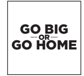
Back (choose one tag line or none)